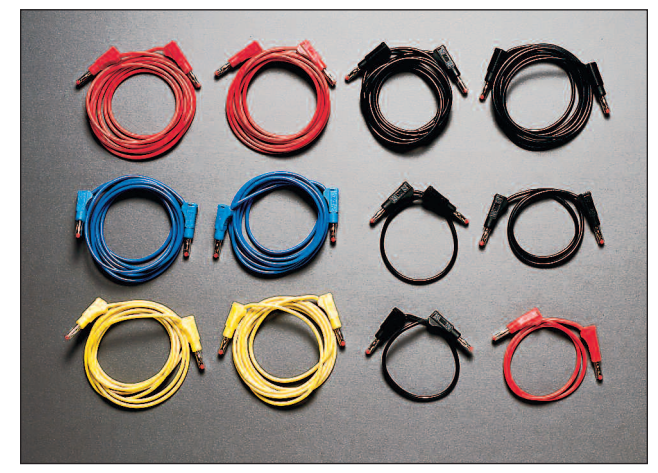
Test lead set